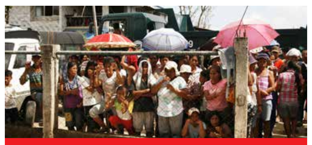
In the aftermath of Typhoon Haiyan, our partner CODE distributes essential items including clean drinking water, rice, tinned corned beef and sardines, cooking oil, soap and detergent.

Cover photo: Drought and erratic rainfall have made farming on Truphena's land a struggle. Now, our partner sends weather forecasts by text message to farmers like Truphena, to help them adapt to changing weather patterns. As a result, Truphena can plan better, increasing her chances of a successful crop.