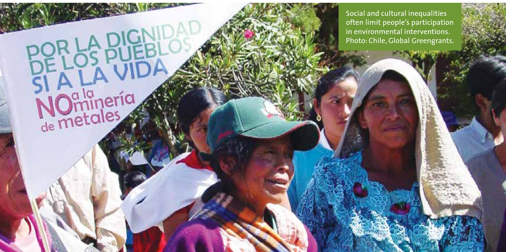
Social and cultural inequalities often limit people's participation in environmental interventions. Photo: Chile, Global Greengrants.

Funders can avoid silos and collaborate more effectively on climate change and women's rights by following the suggestions in this section.