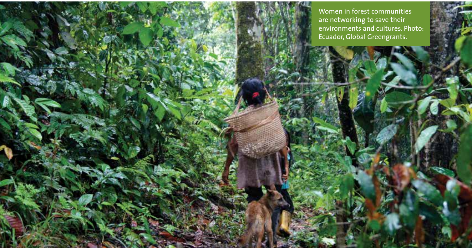
Women in forest communities are networking to save their environments and cultures. Photo: Ecuador, Global Greengrants.