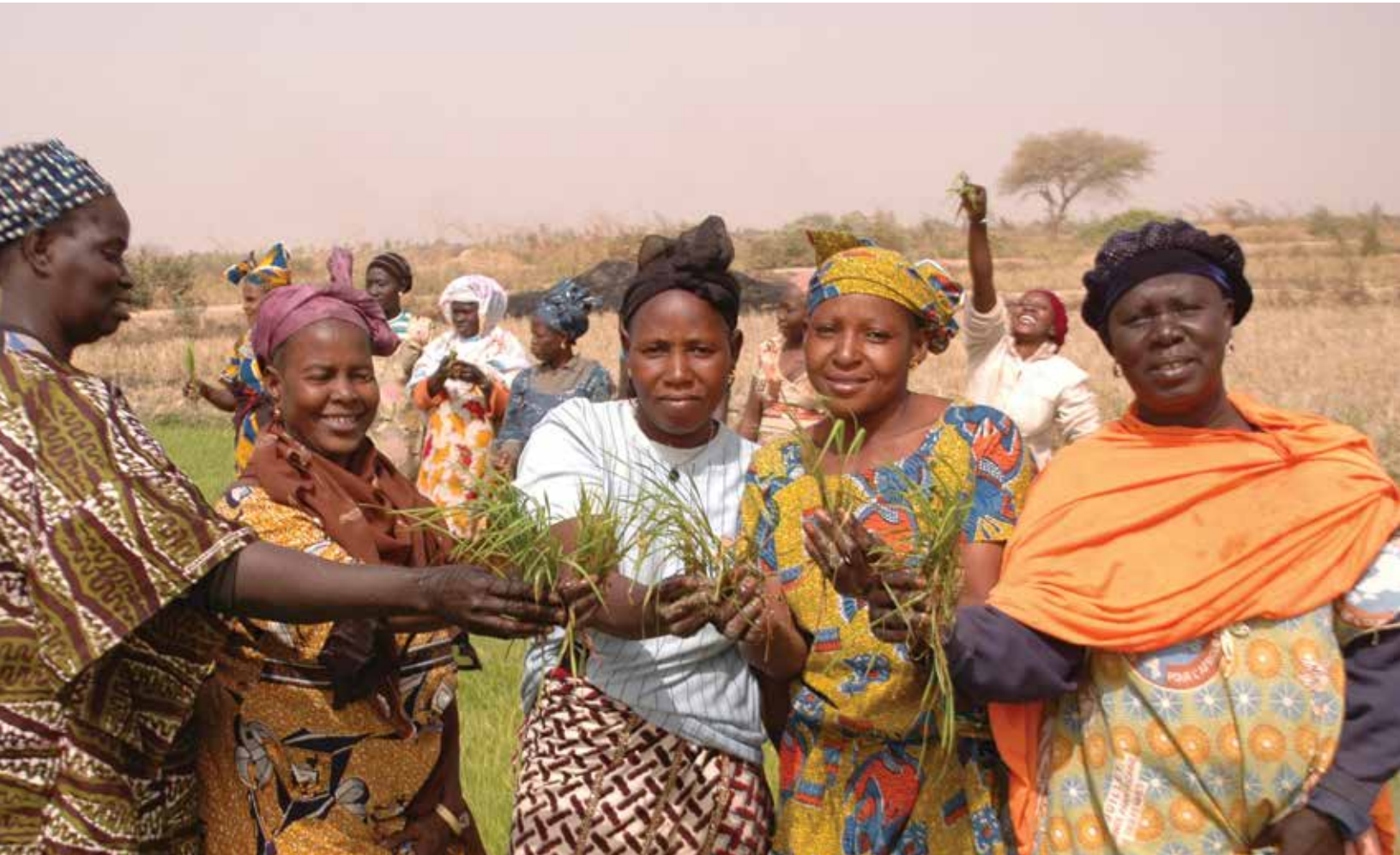
Photos: (cover) Kenya, CIAT / CC BY-SA; (back cover) Mali, Yacouba Sangare/Global Greengrants.