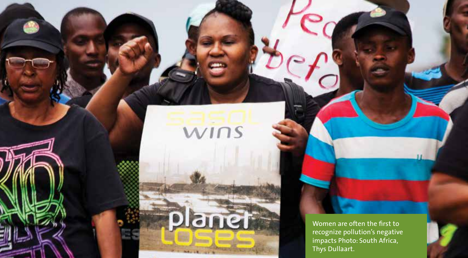
Women are often the first to recognize pollution's negative impacts Photo: South Africa, Thys Dullaart.