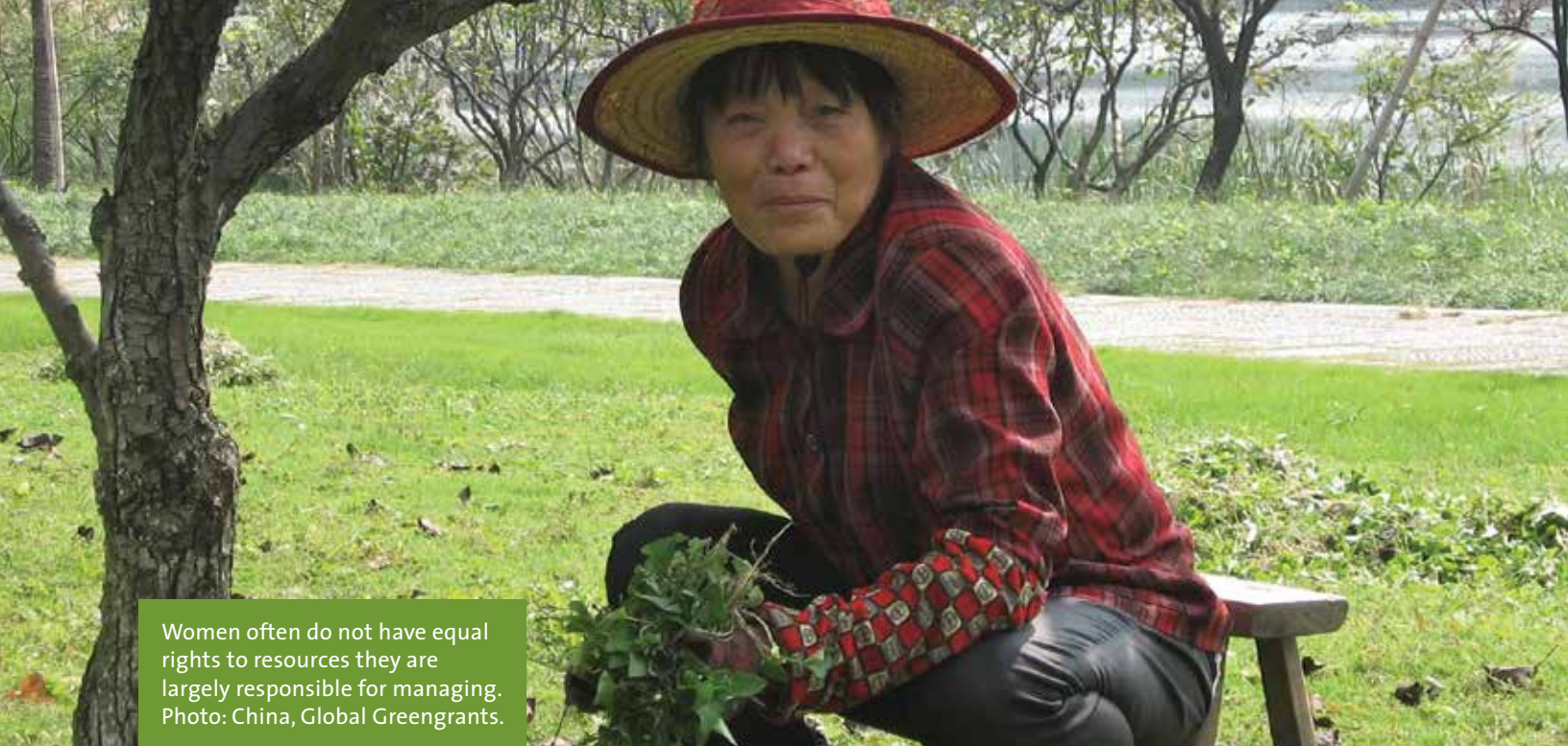
Women often do not have equal rights to resources they are largely responsible for managing. Photo: China, Global Greengrants.

Environment Facility). These funds do not consistently support grassroots women's groups. Although the Adaptation Fund and Global Environment Facility have made some progress on gender equality over the last three years, more work is needed to establish appropriate mechanisms and measurable goals to ensure that a significant percentage of money reaches local, grassroots solutions that serve the interests of women and girls. 20