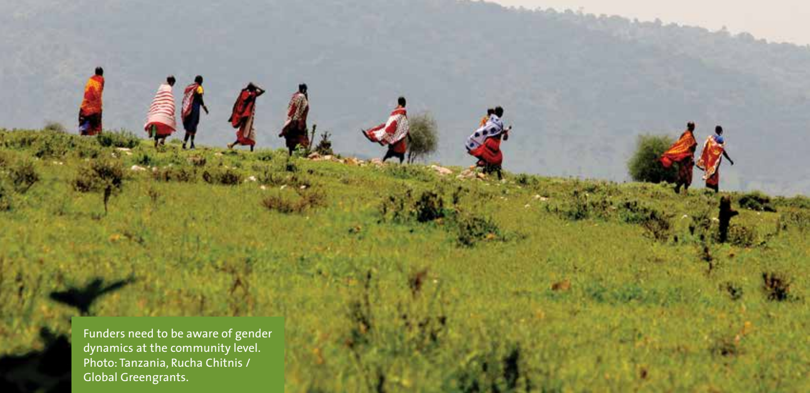
Funders need to be aware of gender dynamics at the community level. Photo: Tanzania, Rucha Chitnis / Global Greengrants.

In recent years, the UNFCCC has moved from an almost exclusive focus on large-scale climate change mitigation actions to a more complex, nuanced set of policies that include action on adaptation, loss and rehabilitation. Much of the credit for this shift is due to members of indigenous rights, environmental justice, women’s and community-based organizations arguing that the countries responsible for climate change must pay not only to reduce emissions, but also to cover communities’ costs in dealing with climate change repercussions.