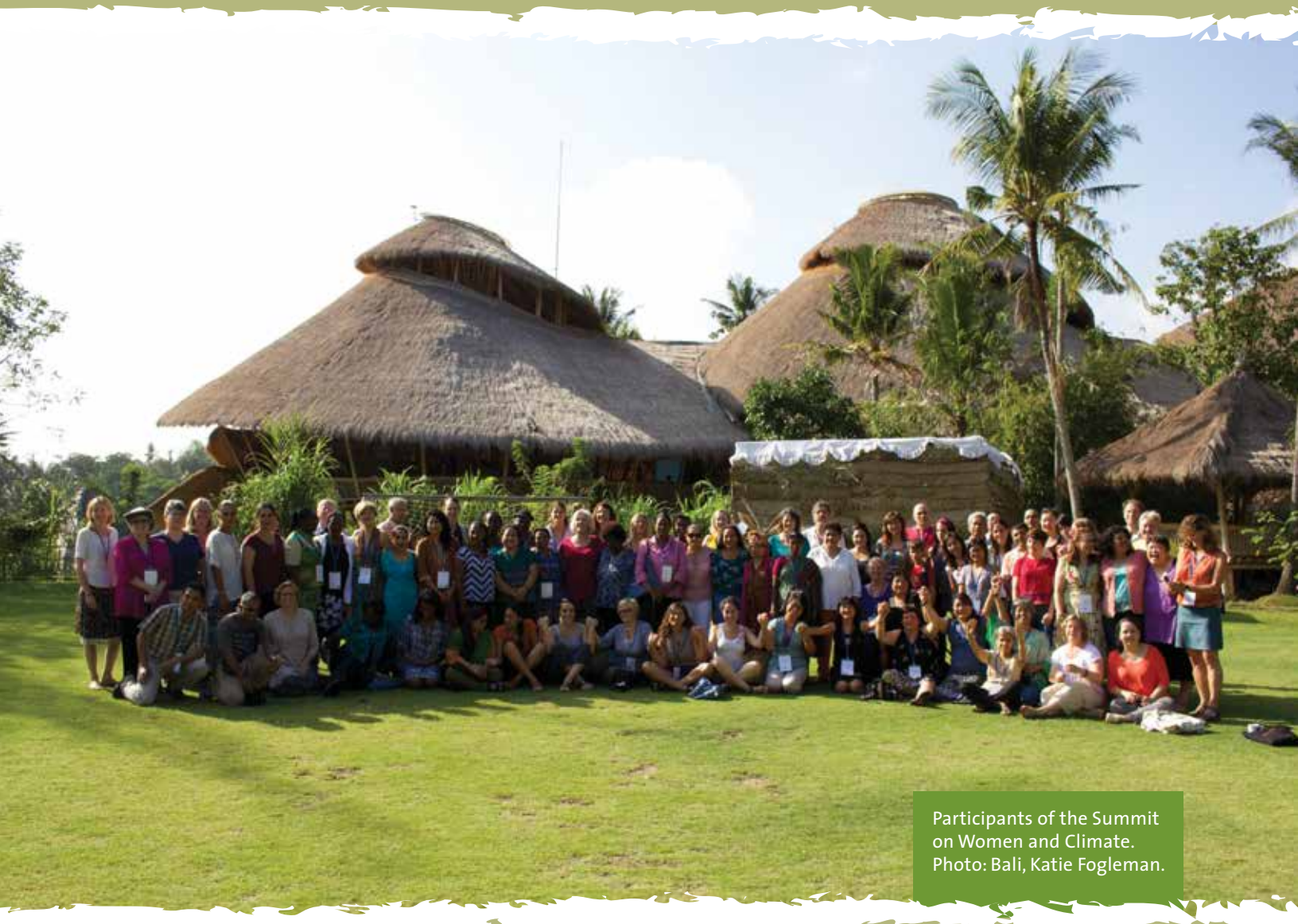
Participants of the Summit on Women and Climate. Photo: Bali, Katie Fogleman.