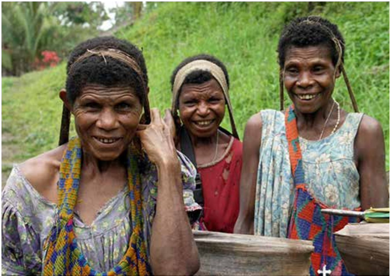
Villagers in the Sepik River Valley of Papua New Guinea.