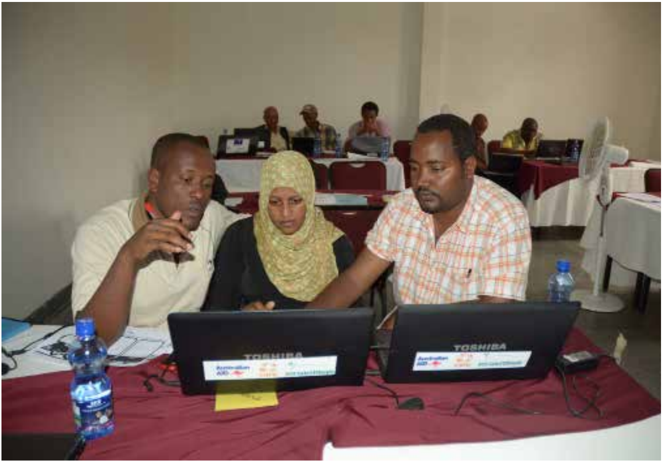
Staff from CARE Ethiopia and SOS Sahel Ethiopia. (Photo: Tamara Plush).

munity groups – including marginalized and vulnerable women – aimed at improving accountability in delivering goods and services. 2