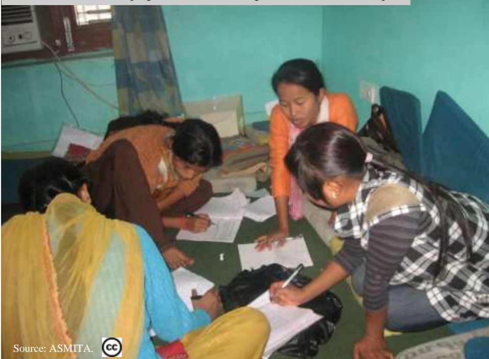
Media consumers developing skills in news writing at an ASMITA workshop

Influential media producers argued that they would be willing to listen to comments on their media products if the comments were raised by common media consumers too, and not only by the experts and analysts.