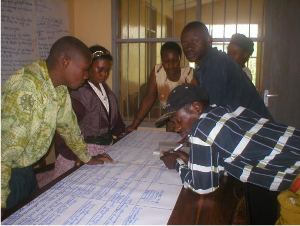
Preparing an action plan during one of the TADEPA training