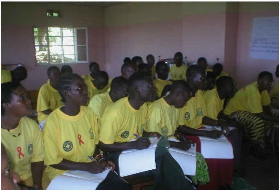
Peer Educators during the training