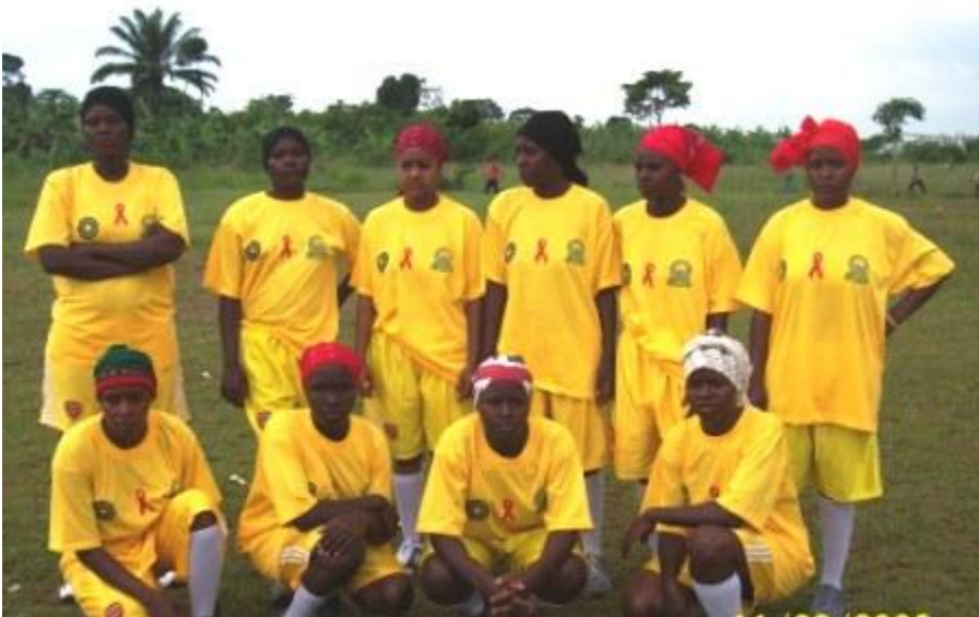
Women footballers during gender and HIV campaign