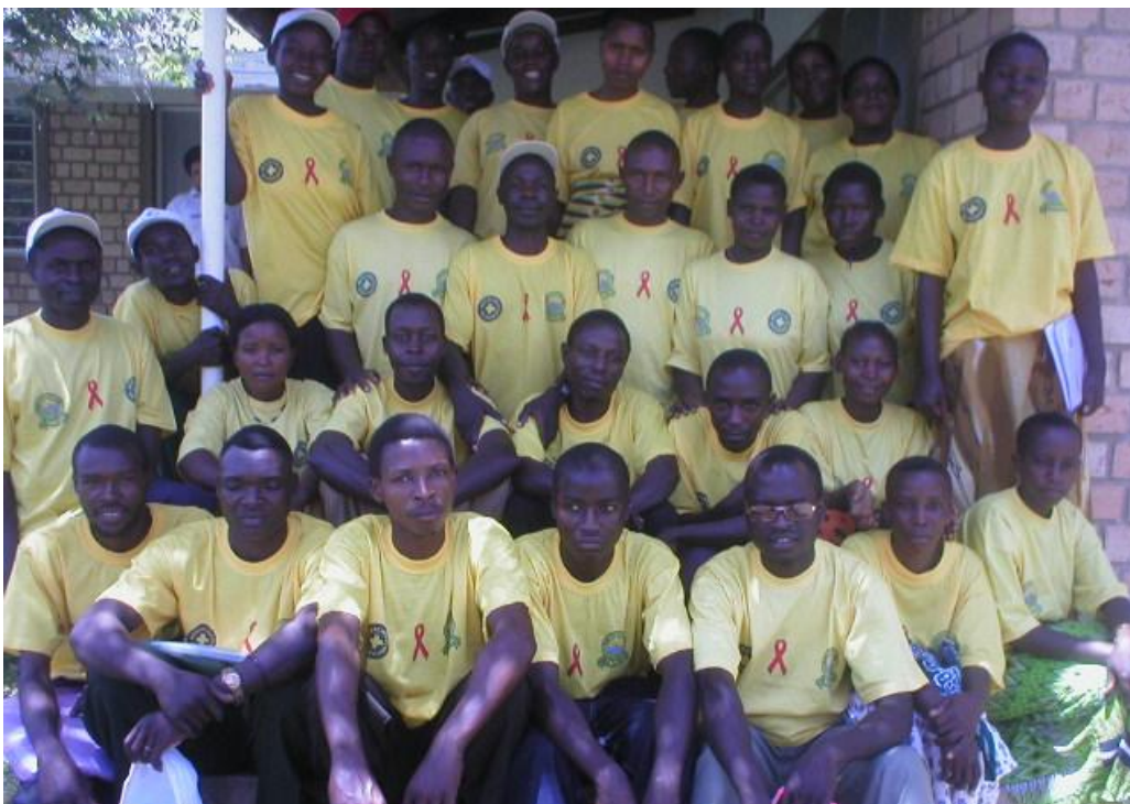
A group photo after Peer Educators training