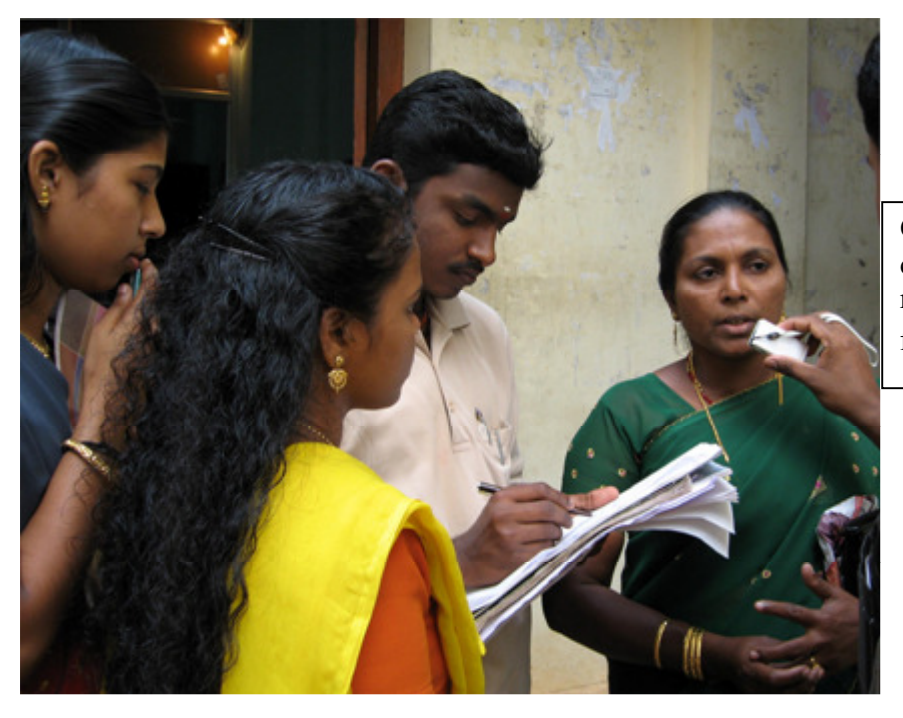
Group I conducting audio recording in the field