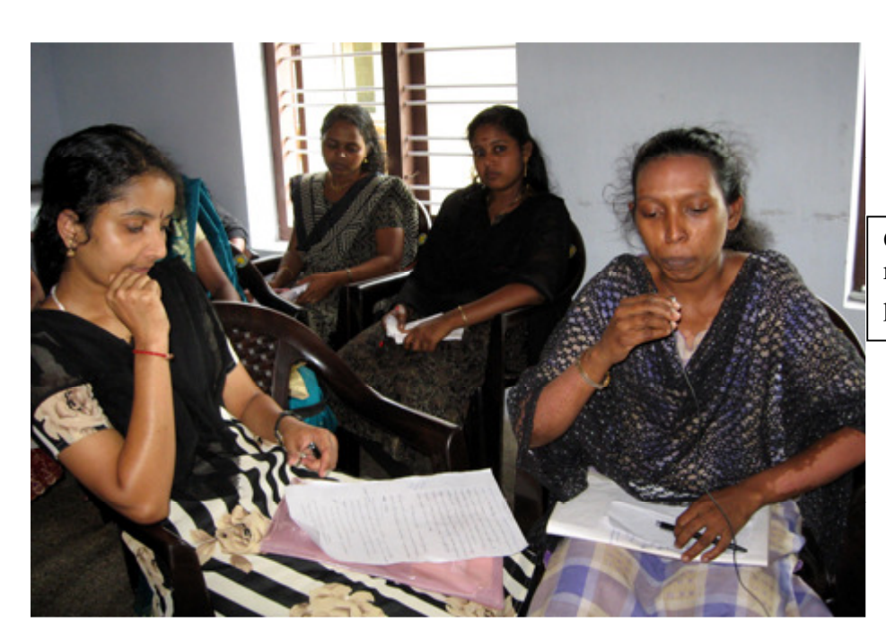
Group III while recording their panel discussion