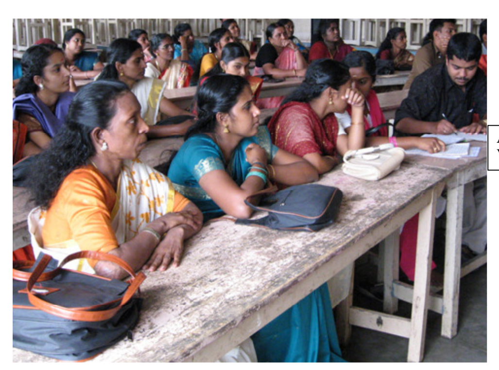
Audience of the Valedictory function