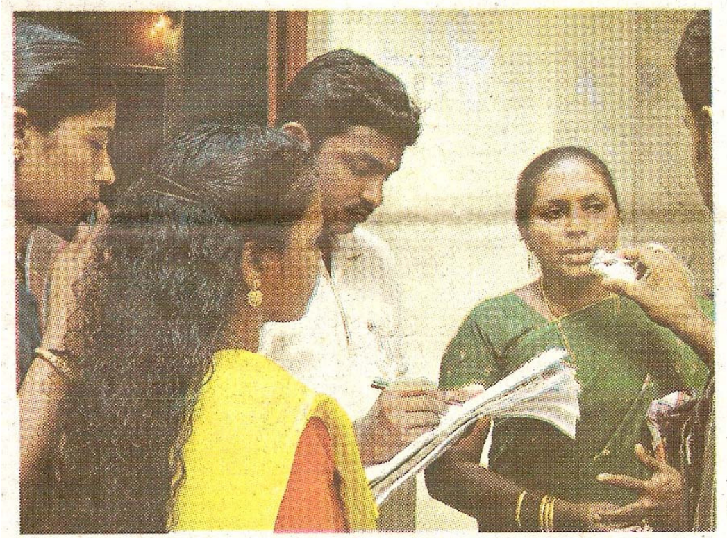
The youngsters of Ottasekharamangalam recording for their community radio initiative: Express

6 Newspaper Clip: The New Indian Express February 26, 2008