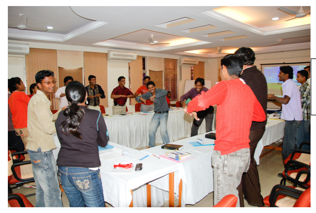
Participants enjoying a light moment