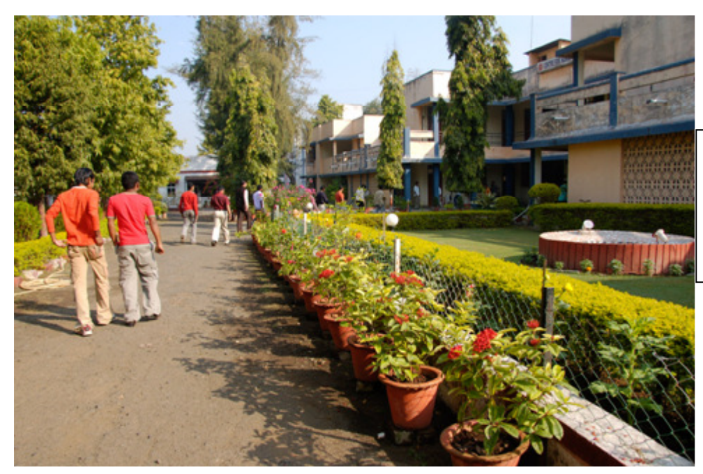
Centre for Human Potential De velop ment, CNI, Nagpur