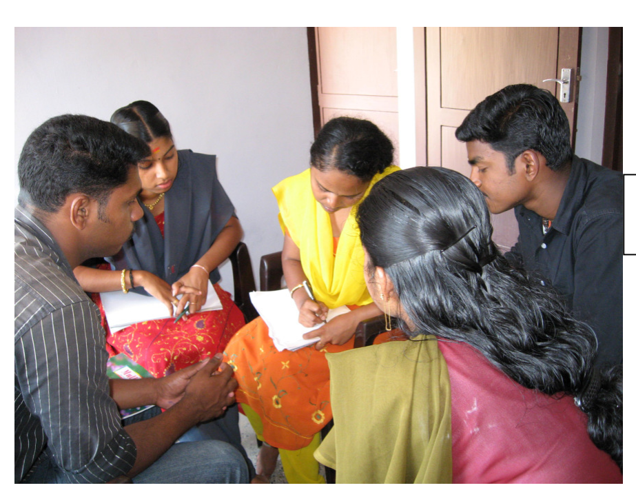
Group I preparing script