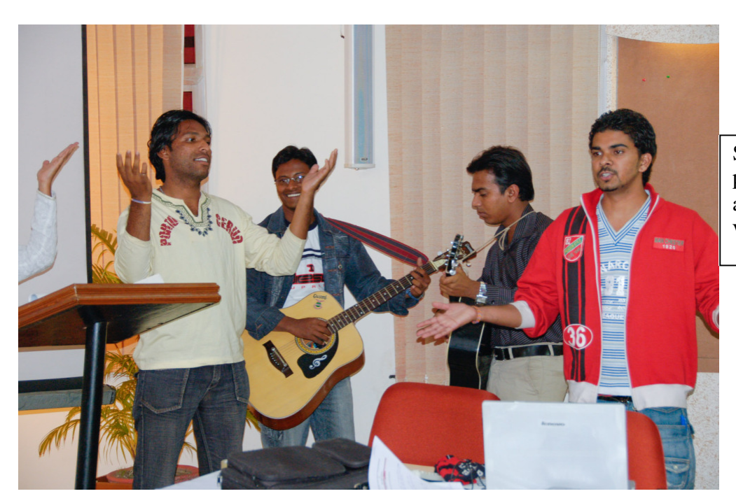
Singing and praising God at the Closing Worship