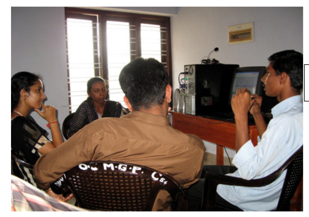
Group III planning their production