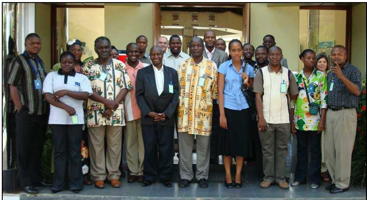
(3) A group photograph of most of the seminar participants