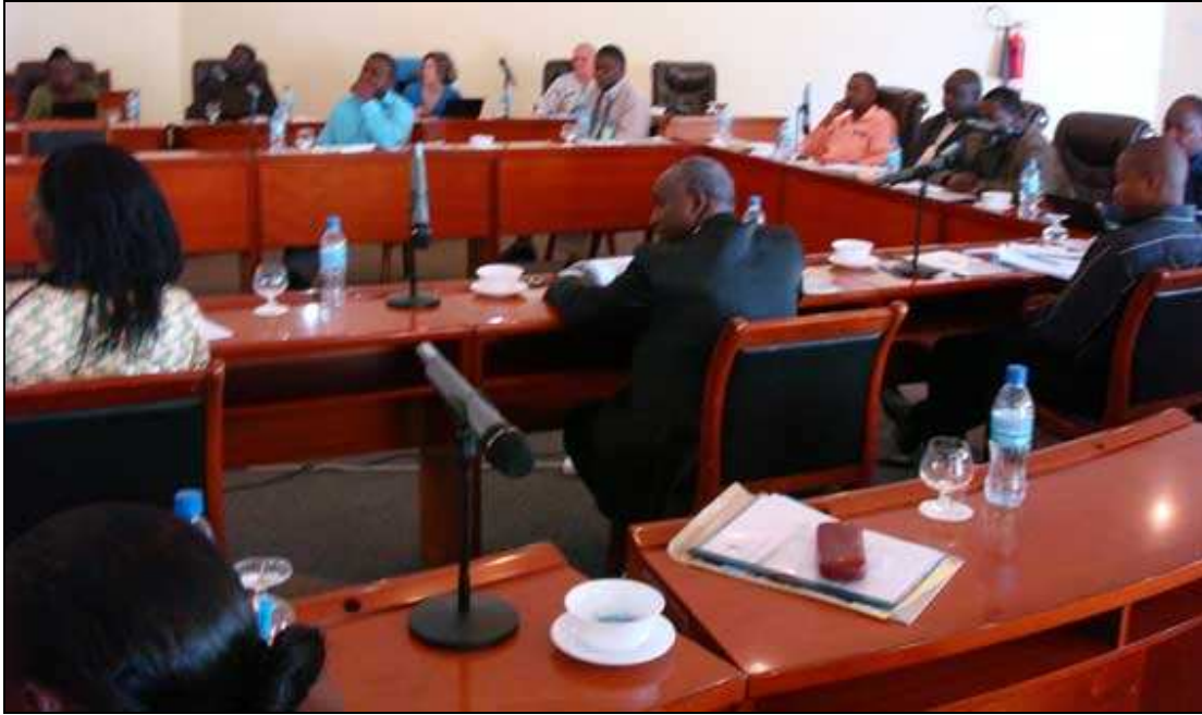
(10) Participants pay keen attention during one of the presentations