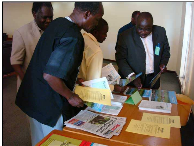
(2) Participants take their copies of displayed resource materials